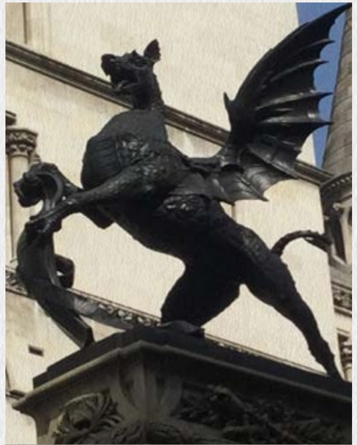
The Dragon marking the western boundary of the City of London on the site of the ancient Temple Bar. It stands in the middle of Fleet Street, where it joins the Strand. The monument was created in 1880 by Sir Charles Bell Birch. It has a statue of Queen Victoria and commemorative plaques on the plinth below the dragon.