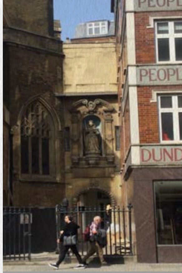
This statue of Queen Elizabeth I originally stood on Lud-gate, which was reconstructed during her reign. It has a barely-legible date of 1586 at the base. Lud-gate was demolished in 1760 and the statue was then placed here. It is believed to be the oldest public statue in London.